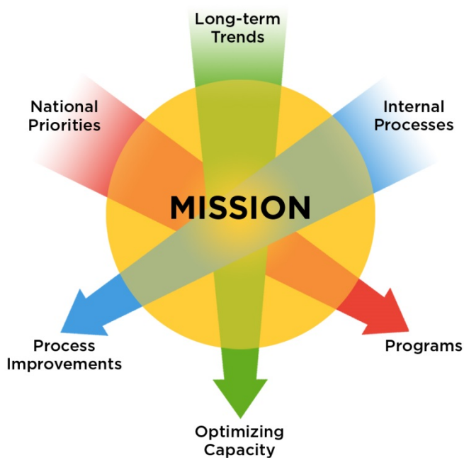
Figure 2 NIST Strategic Framework

To accomplish this, NIST views the possible landscape of activities through the lens of its mission. Through a variety of mechanisms including meetings, workshops, industry visits, objective peer review of its programs, NIST continually collects information on major national issues, shifting trends in science and technology, and the performance of key operational processes. This input is then used to make decisions on where NIST needs to develop specific capabilities, how best to marshal existing resources to address current issues effectively, and how to continually optimize the organization for improved performance.