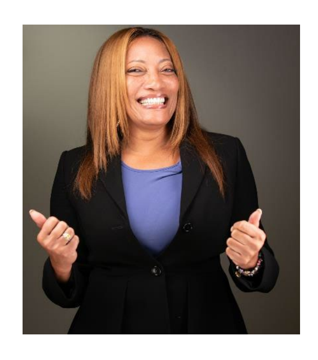
VP of Governance, ISACA Atlanta