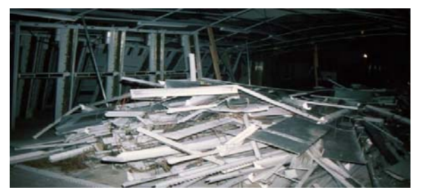
Figure 8-4. Light Fixture and Equipment Failure inside Central Office in Mexico City 1985 Earthquake (OSSPAC 2013)

Placement and security of critical equipment should be considered for all types of natural disasters a community may experience. As illustrated by the Sandy example, different hazard types warrant different considerations. For earthquake, equipment stability must be considered. Figure 8-4 shows an example of failure inside a telecommunications Central Office in the 1985 Mexico City Earthquake (OSSPAC 2013). The building itself did not collapse, but light fixtures and equipment failed. Critical equipment in earthquake prone regions should be designed and mounted such that the shaking