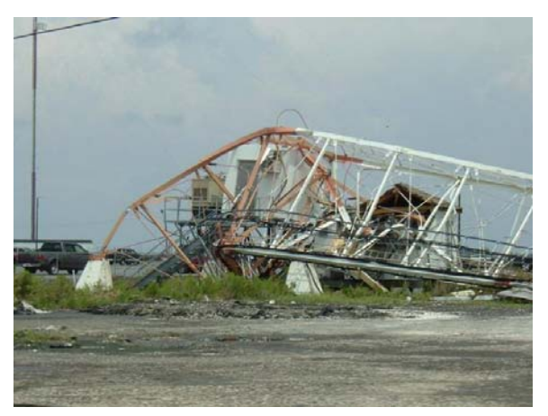
Figure 8-8. Tower Failed Due to Wind During Hurricane Katrina.

More commonly, cell towers are designed to meet the criteria of TIA/EIT-222-G. Prior to the 2006 version of this standard (which is based on the ASCE 7 loading criteria), it used Allowable Stress Design (ASD) rather than Load and Resistance Factor Design, wind loads used fastest mile wind speeds rather 3-second gust, and seismic provisions were not provided. The ice provisions differ from version-to-version, but no major differences in methodology have been noted. Therefore, cell towers designed to meet the criteria of TIA/EIT-222-G should perform well in an "expected" wind, ice or earthquake event. However, older cell towers that have not been retrofitted / upgraded to meet the 2006 version of TIA/EIT-222-G may not perform as well. Specifically, cell towers in earthquake prone