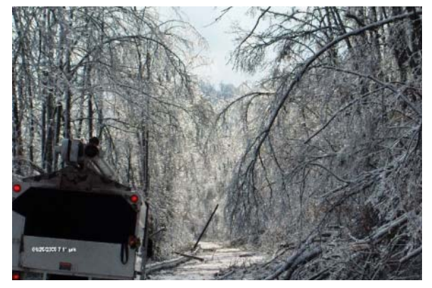
Figure 8-6. Trees Fallen across Roads due to Ice Storm in Kentucky Slowed Down Recovery Efforts (Kentucky Public Service Commission 2009)

Emergency response and restoration of the telecommunications infrastructure after a disaster event is an important consideration for which the challenges vary by hazard. In the case of both high wind and ice/snow events, tree fall on roads (Figure 8-6) slows-down emergency repair crews from restoring power and overhead telecommunications. Ice storms have their own unique challenges in the recovery process. In addition to debris (e.g., trees) on roads, emergency restoration crews can be slowed down by ice-covered roads, and soft terrain (e.g., mud) in rural areas. Emergency restoration crews also face the difficulties of working for long periods of time in very cold and windy conditions which can be associated with these events. Therefore. communities must consider the