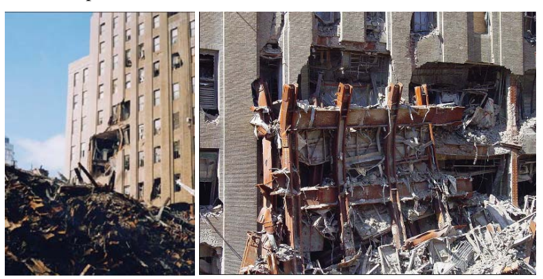
Figure 8-2. Damage to Verizon Building on September 11, 2001 (FEMA 2002)

As learned after the 9-11 terrorist attacks on the World Trade Centers in New York City, redundancy of Central Offices is vital to continued service in the wake of a disaster. On September 11<sup>th</sup>, almost all of Lower Manhattan (i.e., the community most immediately impacted by the disaster) lost the ability to communicate because World Trade Center Building 7 collapsed directly onto Verizon's