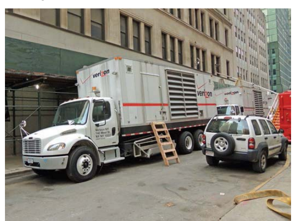
Figure 8-3. Large Standby Portable Power Unit used when Basement Generators Failed (FEMA 2013)

After 9-11, the Verizon Central Office at 141 West Street (i.e., the one impacted by the collapse of WTC 7) was hardened to prevent loss of service in a disaster event (City of New York, 2013). After 9-11, and prior to Sandy, the 141 West Street Central Office: