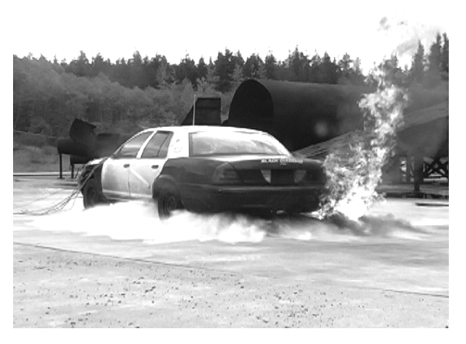
Figure 2. Vehicle during suppression event.