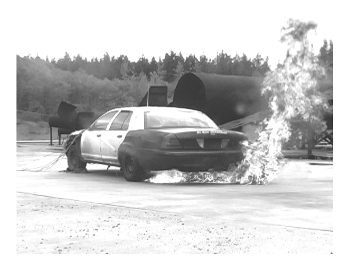
Figure 1. Fire just prior to suppression event.