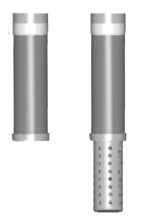
Figure 6 – Deployable Nozzle.

Durable weather seals prevent the accumulation of debris inside the distribution system. The seals are designed to rupture when the system discharges.