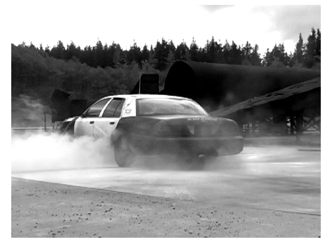
Figure 3. Vehicle just after the fire is suppressed.