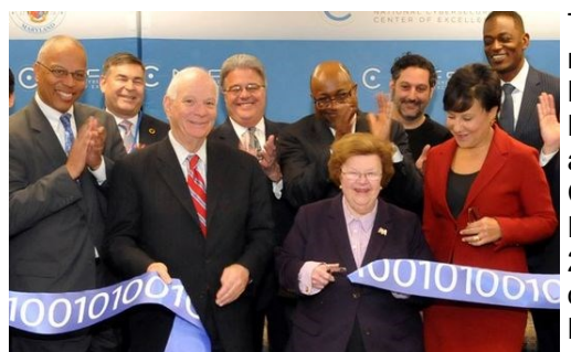
Federal officials and lawmakers gather for the opening of the new National Cybersecurity Center of Excellence Feb. 8.

The NCCoE recently moved from its office at the Universities of Shady Grove into a fully renovated building at 9700 Great Seneca Highway in Rockville, Maryland, to accommodate continued program growth. The new NCCoE office is approximately six times larger than the old space, with 22 labs and space to host events.