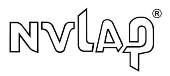
Figure 1. NVLAP logo and caption 1.

FOR THE SCOPE OF ACCREDITATION UNDER NVLAP LAB CODE 000000-0