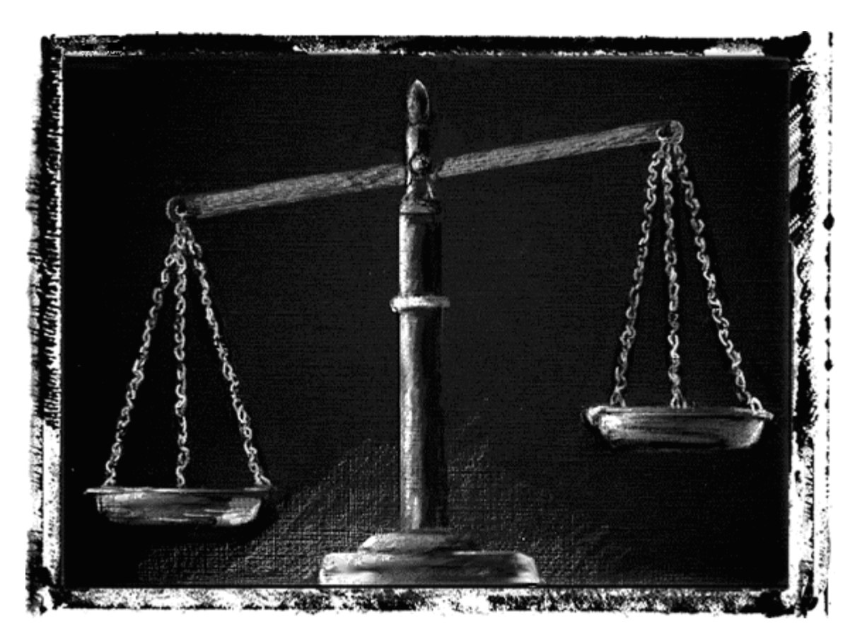
8. Specifications and Tolerances for Field Standard Weight Carts

National Institute of Standards and Technology