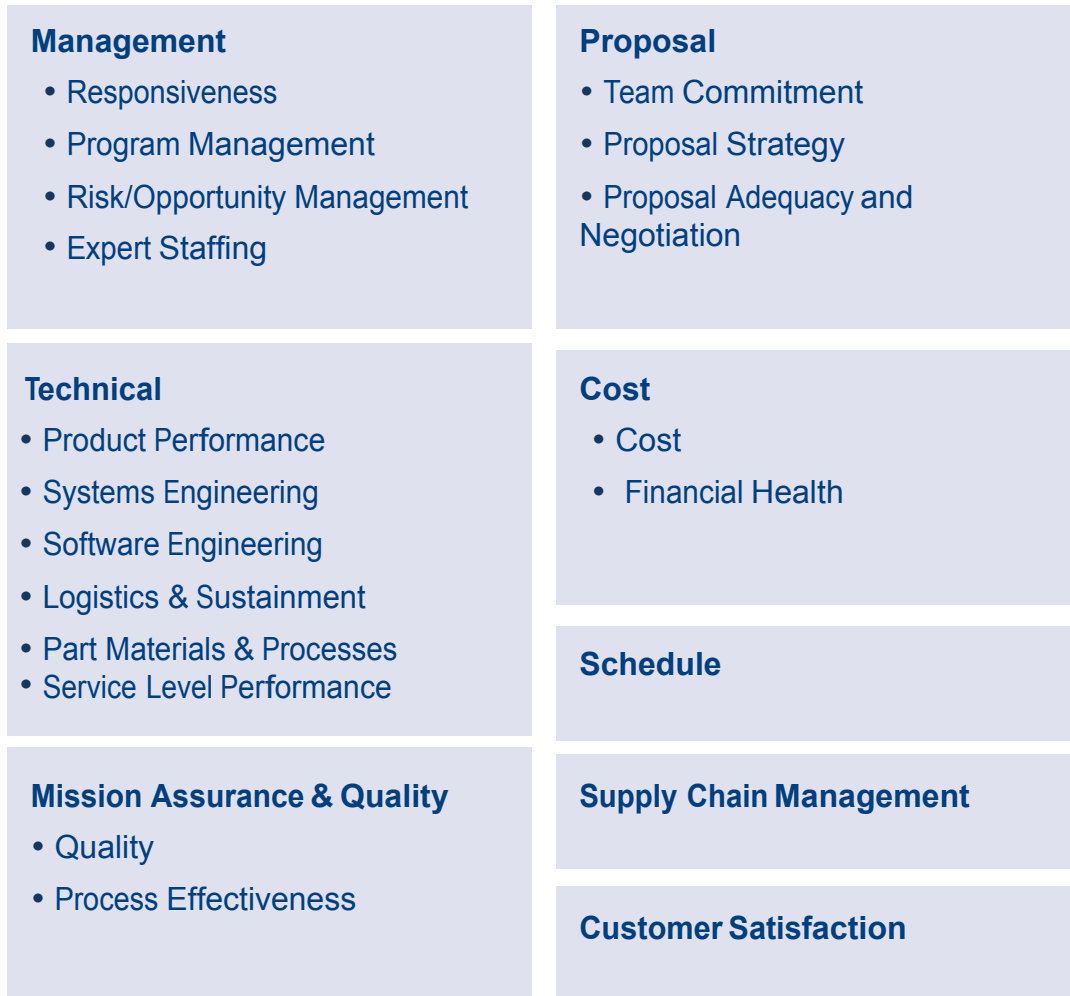
Figure 3. Supplier Assessment Management System (SAMS): 8 Categories of Assessment