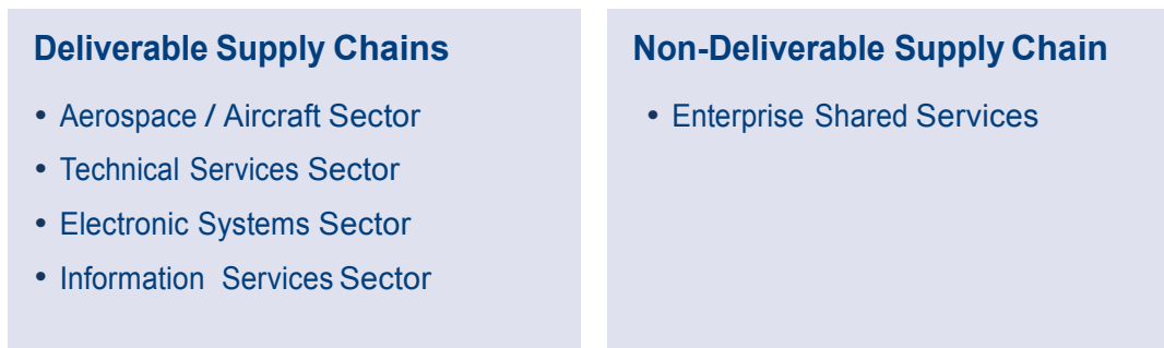
Figure 1. Supply Chain Leader Council (SCLC)

NGC's vision is to be “the most trusted, world-class, innovative supply-chain organization that delivers value to our customers through integration of highly skilled people, suppliers, processes, tools, and communications.” 1