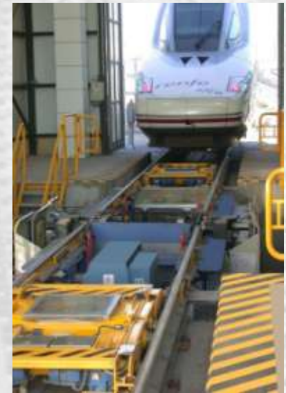
UNDERFLOOR WHEEL LATHE MODEL 3112