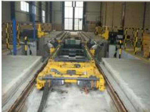
TALGO SHUNTING CARS