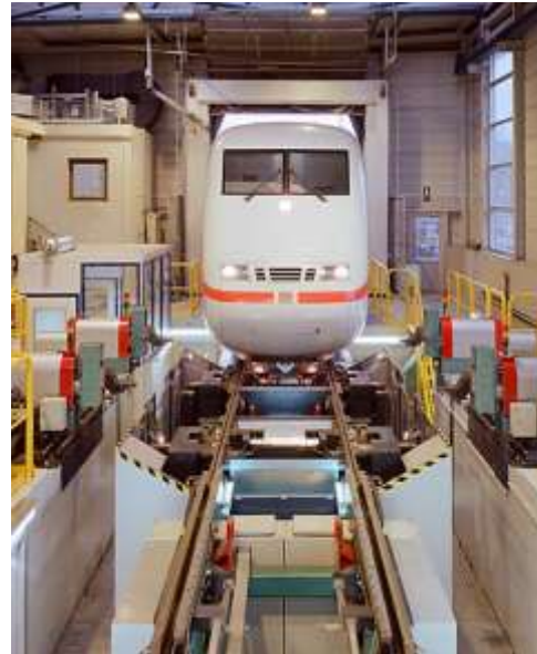
UNDERFLOOR WHEEL LATHE MODEL 4112