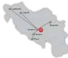
BOSNIA & HERZEGOVINA