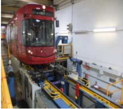
UNDERFLOOR WHEEL LATHE MODEL 2112