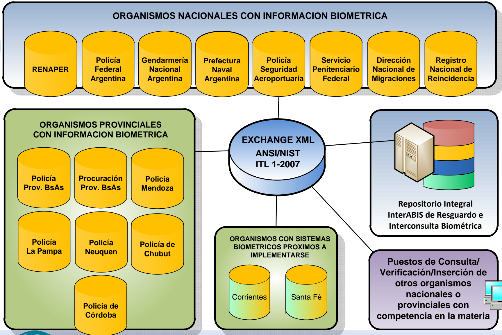
DIAGRAMA CONTANDO LA INTERCONEXION DE LA TOTALIDAD DE ORGANISMOS CON CONSULTA BIOMETRICA