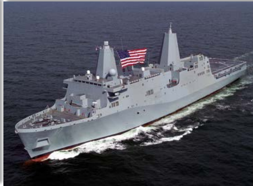
LPD 17 San Antonio Class Amphibious Transport