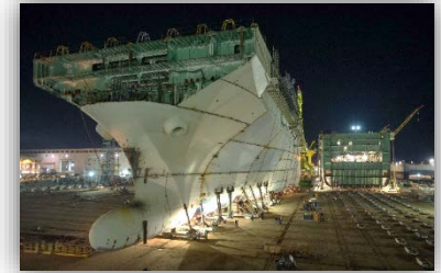
LHA 6 Amphibious Assault Ships