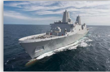
LPD 17 Amphibious Transport Docks