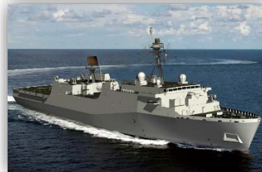
LPD 28 Awarded