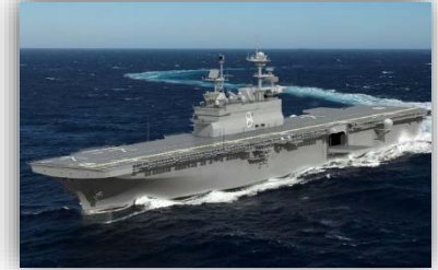
LHA 8 Awarded