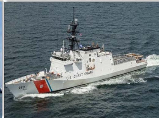
USCG Legend Class National Security Cutter