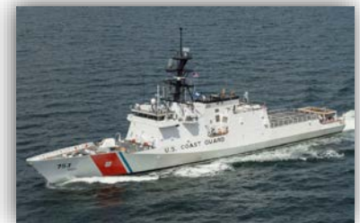
NSC 9 Awarded