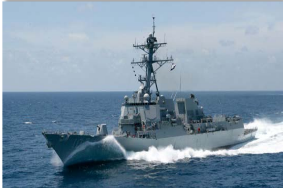
DDG 51 Class Aegis Destroyer Surface Combatant