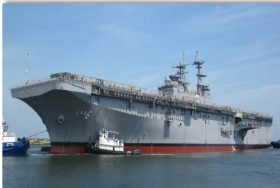
LHA 6 America Amphibious Assault Ship