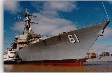
USS Ramage DDG 61 Overhaul