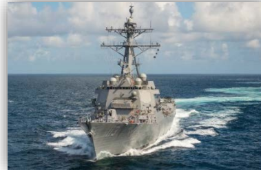
DDG 51 Surface Combatants