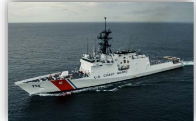
USCG National Security Cutters