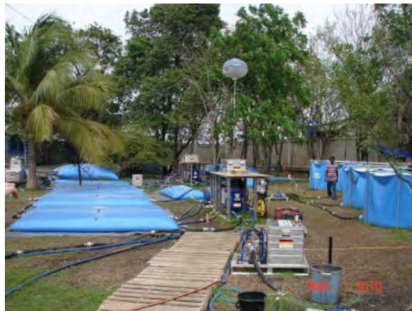
Figure 9.10 Temporary water treatment plant, Haiti earthquake, Port Au Prince, 2010