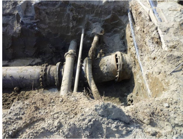
Figure 9.8 Pipeline damage due to differential settlement between ground and pile supported building, Tohoku earthquake, Japan, 2011 (Source: Tang & Edwards, 2014)