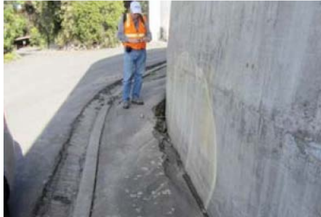
Figure 9.15 Ground failure adjacent to concrete reservoir, Christchurch earthquake, Christchurch, New Zealand, 2011