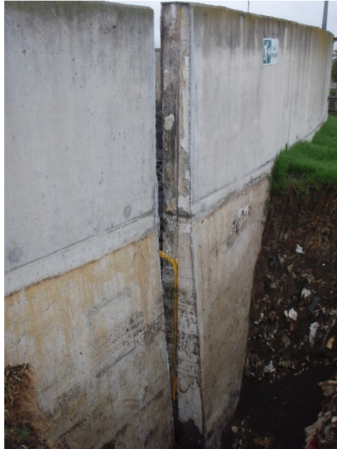
Figure 9.20 Process tank joint offset due to permanent ground deformation, Maule earthquake, Chile, 2010