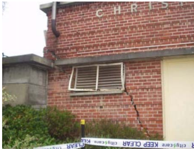
Figure 9.11 Pump station damage due to differential settlement, Christchurch earthquake, Christchurch, New Zealand, 2011