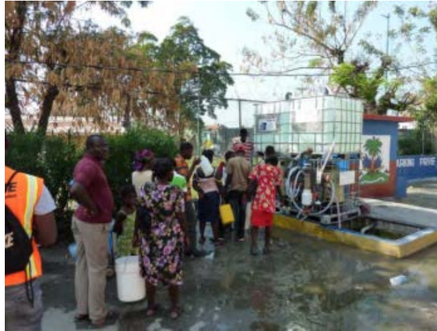
Figure 9.7 Water distribution location, Haiti earthquake, Port Au Prince, 2010