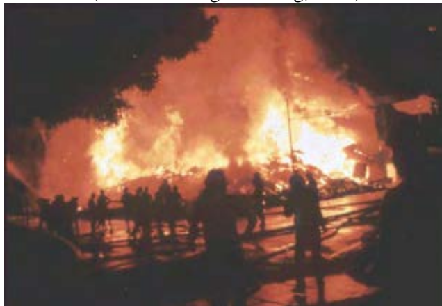
Figure 9.5 Fire in San Francisco Marina District, Loma Prieta earthquake, California, 1989