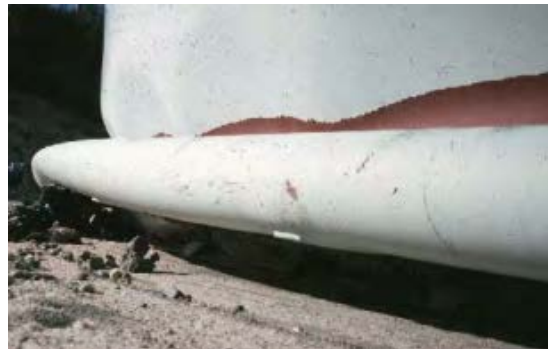
Figure 9.13 Steel tank "elephant's foot" buckling, Northridge earthquake, California, 1994