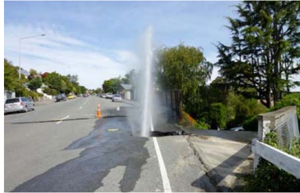
Figure 9.1 Water pipeline break, Christchurch earthquake, Christchurch, New Zealand, 2011