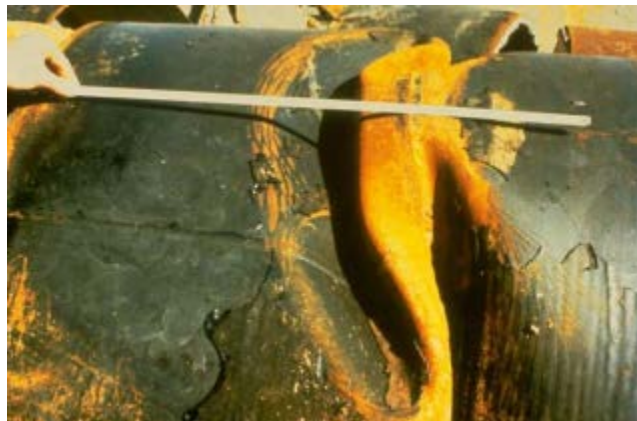
Figure 9.3 Welded steel pipe compression failure, San Fernando earthquake, California, 1971