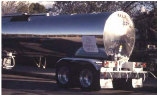
Figure 9.6 Water distribution tanker, Northridge earthquake, California, 1994