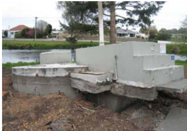
Figure 9.28 Pump station well floated and tilted due to liquefaction, Christchurch earthquake, Christchurch, New Zealand, 2011