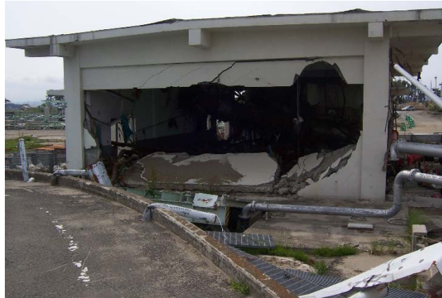
Figure 9.29 Structural damage from tsunami wave and debris impact, Tohoku earthquake, Japan, 2011