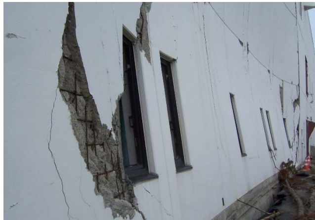
Figure 9.30 Structural damage from tsunami wave and debris impact, Tohoku earthquake, Japan, 2011