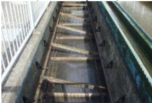
Figure 9.24 Damage to chain-driven scraper, Tohoku earthquake, Japan, 2011