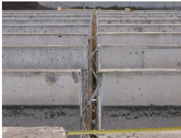
Figure 9.21 Chlorine contact tank joint separation due to permanent ground deformation, Maule earthquake, Chile, 2010