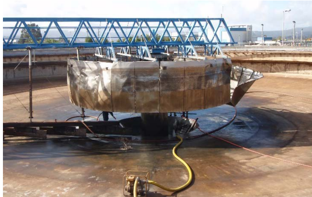
Figure 9.23 Clarifier equipment damage due to sloshing, Maule earthquake, Chile, 2010