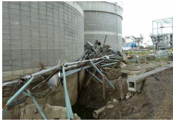
Figure 9.26 Collapse of pipe rack next to digesters due to tsunami scour, Tohoku earthquake, Japan, 2011