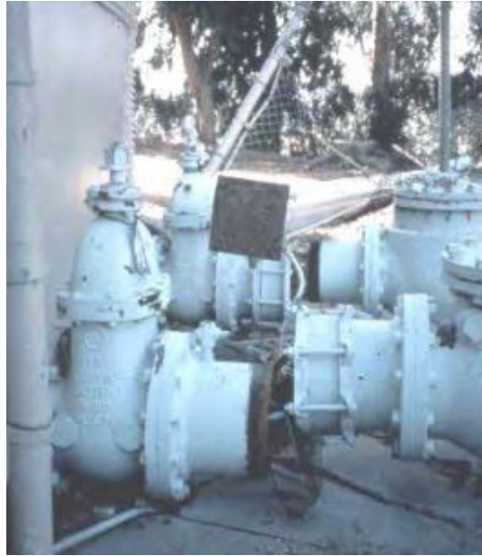
Figure 9.12 Tank piping separated, Northridge earthquake, California, 1994