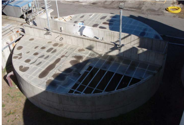
Figure 9.22 Process tank roof damage due to sloshing, Maule earthquake, Chile, 2010