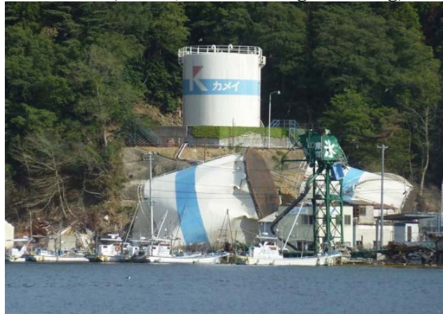
Figure 9.16 Steel tanks displaced due to tsunami inundation, Tohoku earthquake, Japan, 2011