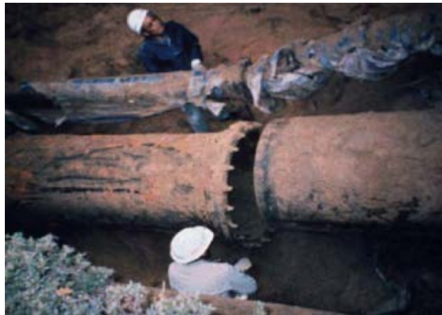
Figure 9.2 Pipeline separated, Great Hyogoken-Nanbu earthquake, Kobe, Japan, 1995