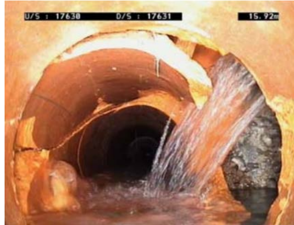
Figure 9.18 Sewer pipeline break, Christchurch earthquake, Christchurch, New Zealand, 2011