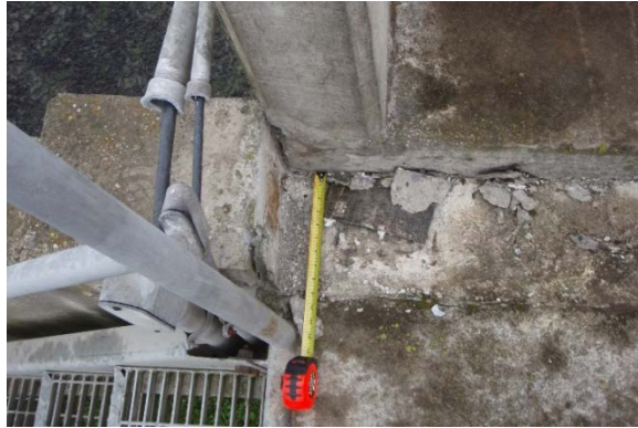
Figure 9.25 Damage to electrical conduit due to bridge movement, Maule earthquake, Chile, 2010