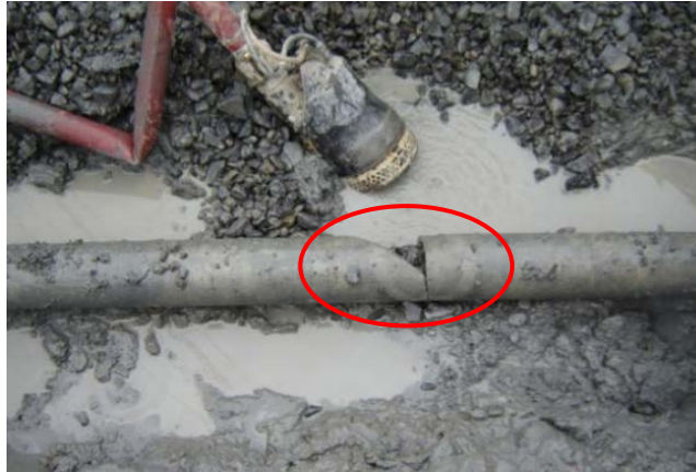
Figure 9.4 Water pipeline break, Christchurch earthquake, Christchurch, New Zealand, 2011