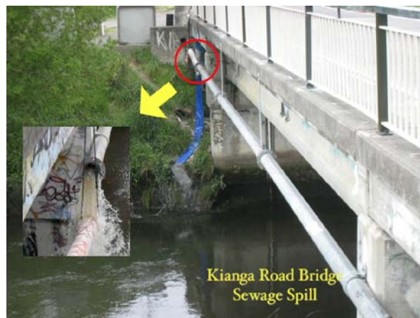
Figure 9.19 Sewer pipeline break due to bridge support settlement, Christchurch earthquake, Christchurch, New Zealand, 2011