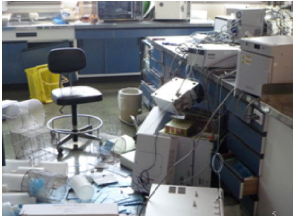
Figure 9.9 Toppled laboratory equipment, Tohoku earthquake, Japan, 2011