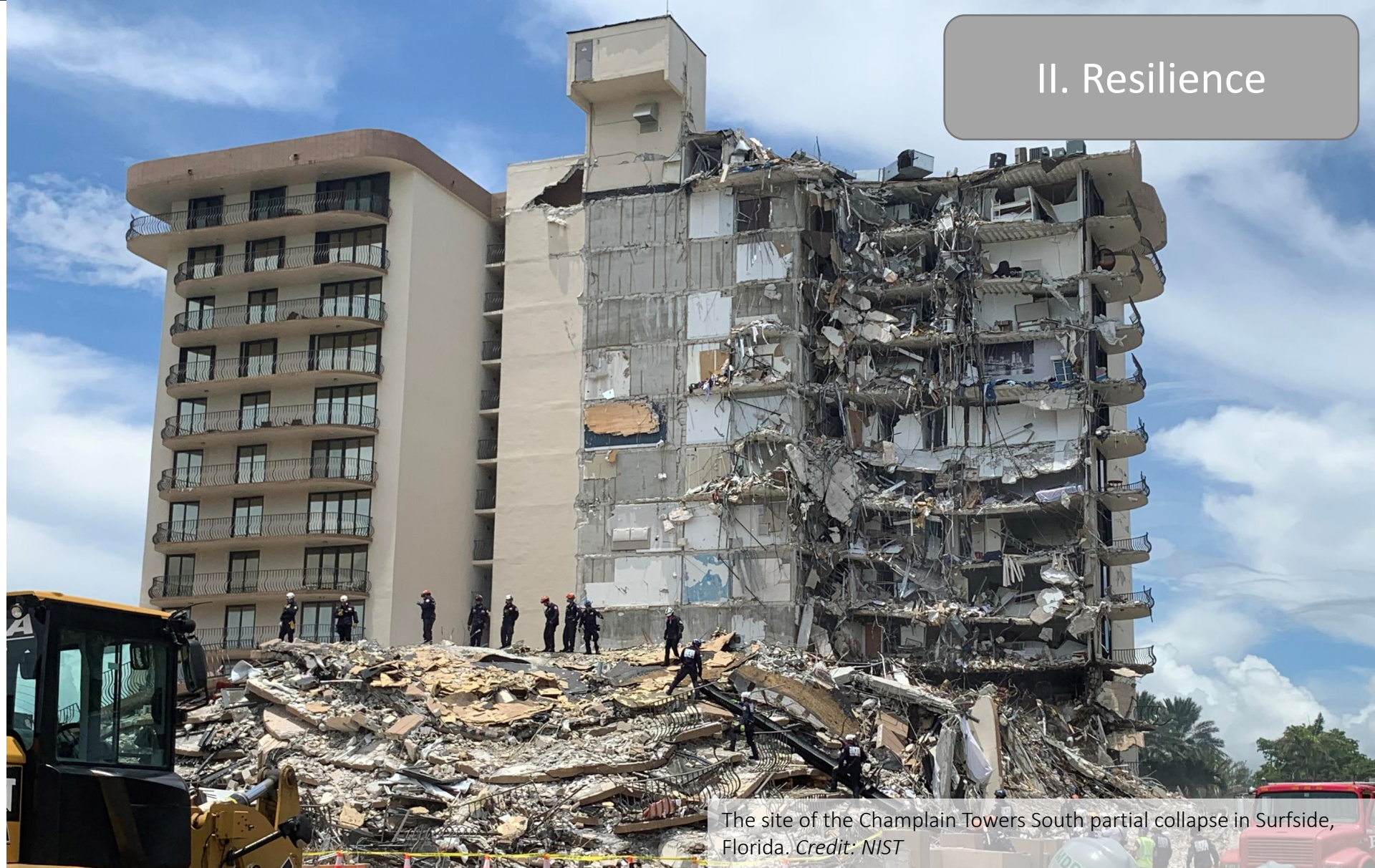
The site of the Champlain Towers South partial collapse in Surfside, Florida.