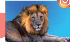
The edited version was posted on Instagram.