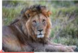
Sent a copy of image to friend.