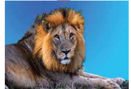
The image was edited and the background was replaced.

Deepfake (synthesized media) is visual, auditory, or multimodal content that has been artificially generated or modified.