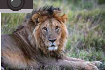
Original image from camera.