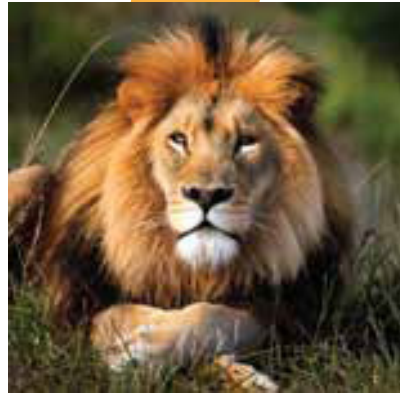
Someone replaced the original photo with a deepfake (completely synthetic).

Deepfake (synthesized media) is visual, auditory, or multimodal content that has been artificially generated or modified.