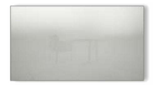
Active Shooter Scenario