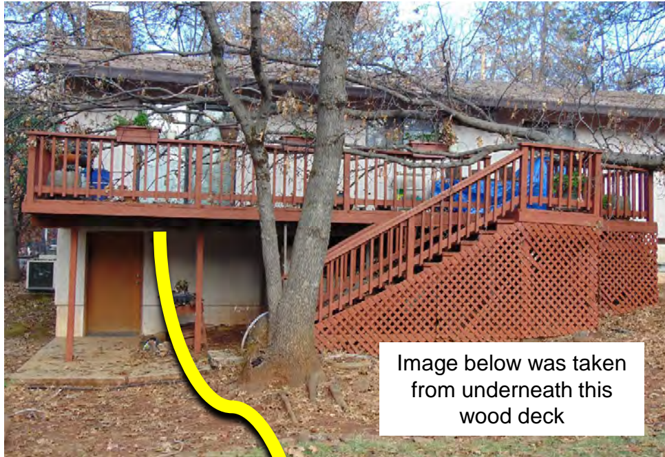
Image below was taken from underneath this wood deck