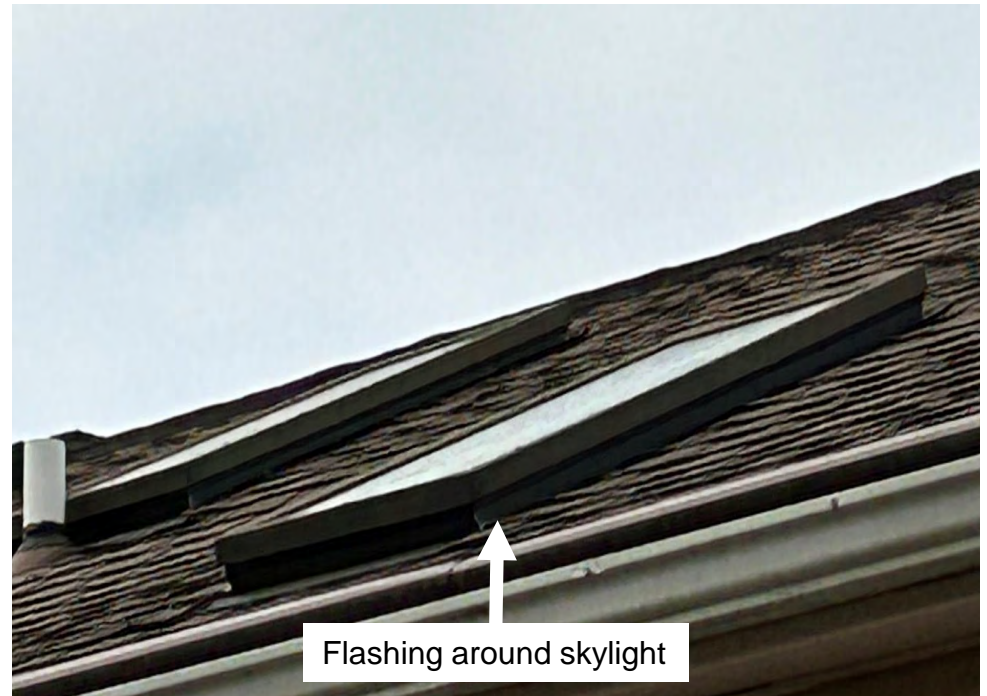
Flashing around skylight

Item 2 Roof to Skylight Flashing – Flashing to protect sides of skylight to prevent against combustible debris ignition and embers.