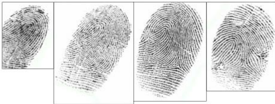
Figure 3: Segmented slap images as used in FpVTE — Note rotation