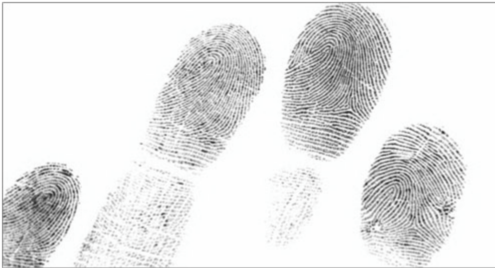
Figure 2: Unsegmented 4-finger slap image (Unsegmented images are not used in FpVTE)

Figure 2 and Figure 3 show an example of a good-quality livescan slap image before and after segmentation. Note that part of the little finger was not included in the slap image: incomplete fingerprints such as this can sometimes occur with any finger in slap images.