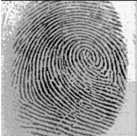
Figure 1: Sample Flat Fingerprint