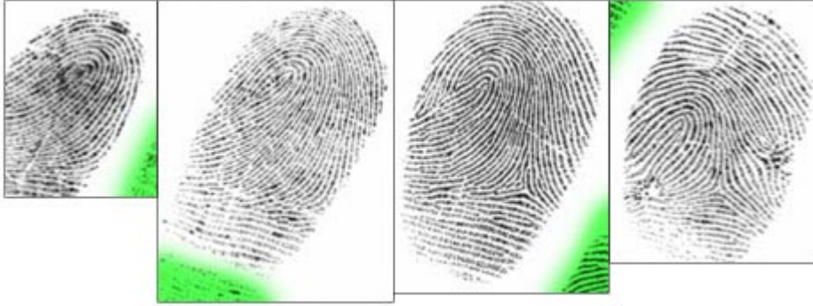
Figure 4: Segmented slap images showing extraneous ridge detail excluded in FpVTE