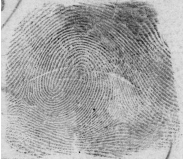
Figure 5: Sample Rolled Fingerprint (Scanned from Paper)