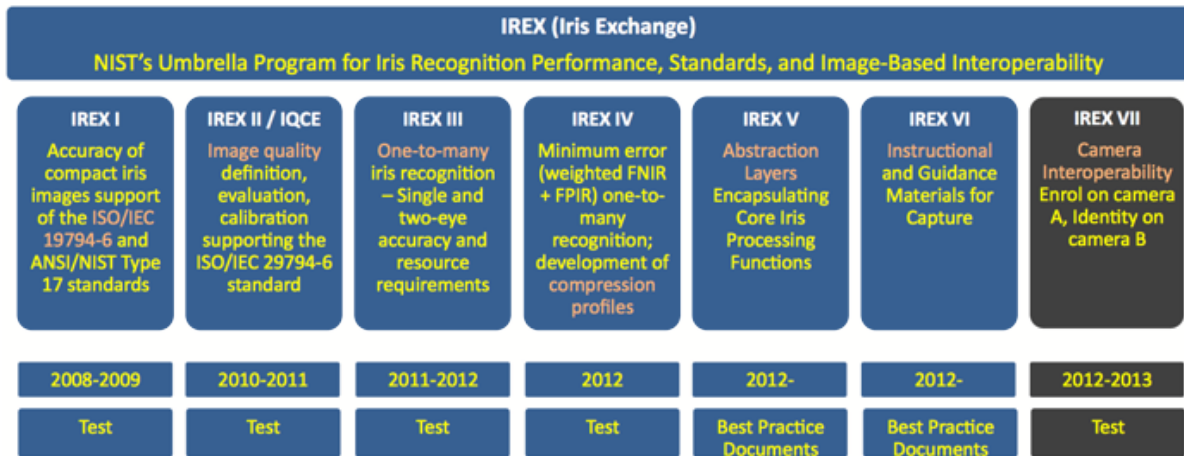
Figure 1: Current extent of the IREX program as well as planned expansions.

68 • Some mobile cameras can be preloaded with firm-ware based segmentation and identification capability for 69 rapid one-to-many watchlist searches.