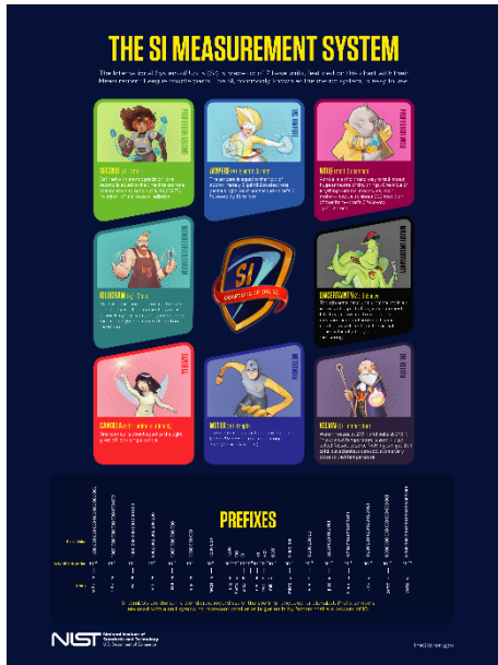
Figure 1. The SI Measurement System poster.