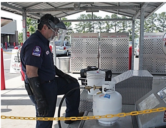
Figure 2. An example of a Direct Sale Refilling Station.