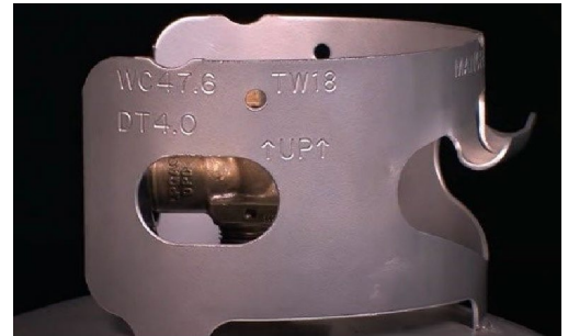
Figure 1. An example of Stamped Tare Weight (TW) on the collar of the cylinder.

Phase I: Point of Pack. Phase I is scheduled to occur during February 2022. The purpose is to determine the accuracy of the stamped tare weight compared to the actual tare weight of new and used cylinders. This will be determined by data collected primarily at the plant location. These results will be used to inform the NCWM and states if they should petition the Department of Transportation (DOT) to reconsider its regulations issued in a Final Rule (49 CFR § 178.35 “General Requirements for Specification Cylinders” in the Federal Register of December 28, 2020) that take effect December 28, 2022. These requirements will preempt and significantly relax the requirements currently found in NIST Handbook 130.