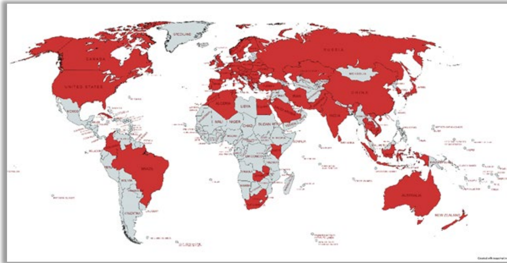
Figure 1. OIML Member States (62) ; created by mapchart.net

The International Committee of Legal Metrology (“CIML”) is the functional decision-making body of OIML. CIML Members (one per Member State) are designated by their government. The CIML Members are the main permanent contact of the OIML in the Member States. They have a double role in representing their country both on the Committee, and in the OIML. They are in principle officials in the department concerned with measuring instruments or have active official functions in the field of legal metrology. The U.S. Department of State serves as the official U.S. Member of OIML, and delegates a representative from NIST to serve as U.S. CIML Member. According to Article IX of the OIML Convention, “The Conference shall elect from its Members, for the duration of each of its sessions, a President and two Vice Presidents to whom is attached the Director of the Bureau, as secretary”, where the Bureau is the International Bureau of Legal Metrology (“BIML”) , the headquarters office of OIML, located in Paris, France.