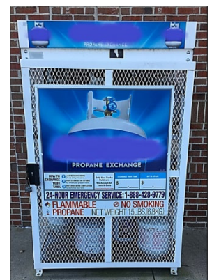
Figure 3. An example of a cylinder cage at a customer exchange location.

cylinder exchange. The results are anticipated to demonstrate the impact of both underfill and overfill on both consumers and industry and may prompt the need for the development of new “good quantity control practices” for the LPG industry. The results may also be used to determine if current industry filling procedures are being followed. The results are anticipated to assist and inform states of any present need to better cooperate with their stakeholders (e.g., Propane Education and Research Council, National Propane Gas Association (NPGA), National Fire Protection Association, OSHA, U.S. DOT) to establish improved procedures and oversight.