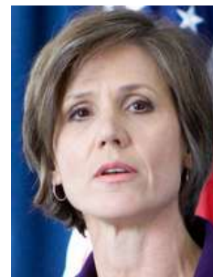
Sally Q. Yates Acting Deputy Attorney General DOJ Co-Chair

Next meeting (6 th ): April 30-May 1, 2015