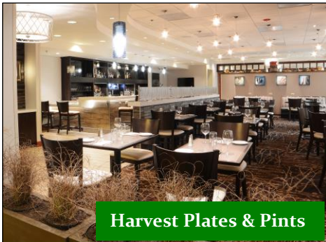
Harvest Plates & Pints

Holiday Inn Gaithersburg 2 Montgomery Village Avenue Gaithersburg, MD 20879 301-948-8900