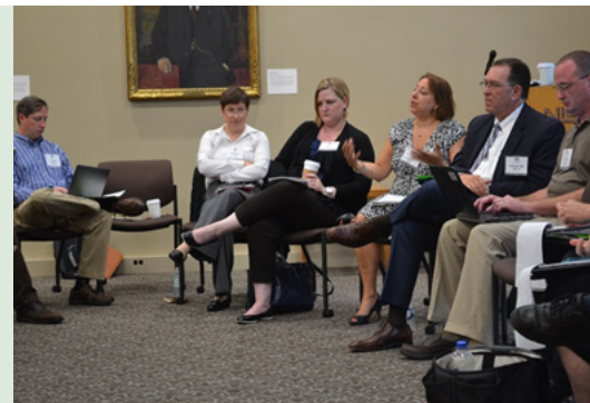
OSAC resource committees collaborate at recent meetings at NIST.