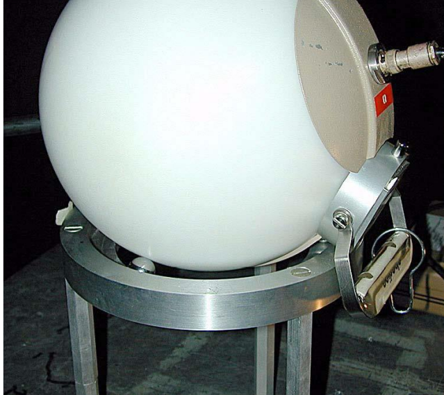
Figure 2: Ring stand used to hold “9-inch” rem ball.

mm to 915 mm was 0.259 mm). All other rulers used in these service IDs have been compared against this ruler to establish traceability.