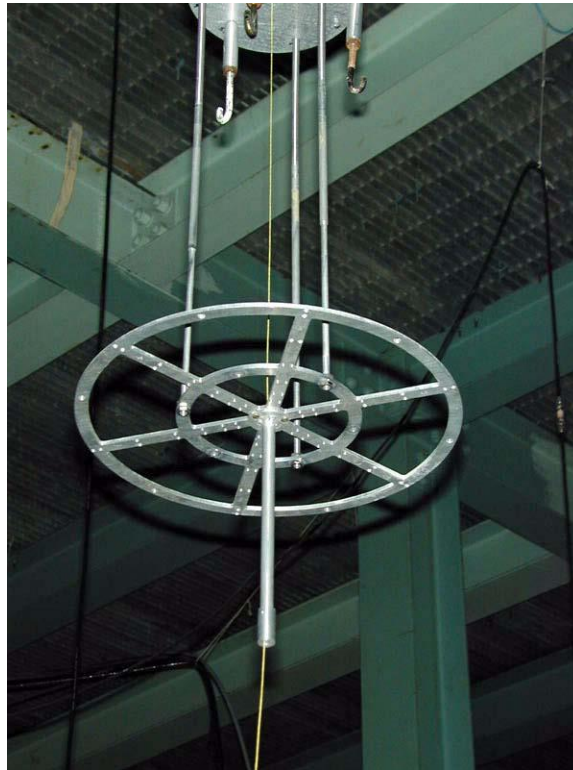
Figure 1: Source positioning apparatus.

The height of the most standard size rem ball above the rolling cart platform is set using a ring stand specifically designed and constructed for this purpose. A grooved circular ring, pictured below as both a photograph (Figure 2) and as a mechanical drawing (Figure 3), holds three 19.05 mm (0.75") diameter ball bearings. The center of a so-called "9-inch" rem ball above the bottom of the grooved ring with the ball bearings in position is calculated to be 11.41 cm. Aluminum legs are attached to the ring to position the rem ball above the rolling table platform. The heights of the bare and D 2 O-moderated sources above the rolling table platform have been measured in the past and are 31.9 cm and 30.3 cm, respectively.