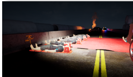
Mass Casualty Triage Scenario