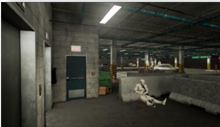
Active Shooter Scenario

PSCR's User Interface and User Experience (UI/UX) Research Portfolio team developed three public safety virtual reality (VR) environments across fire, SWAT, and emergency medical service (EMS) scenarios. These environments were created in partnership with public safety agencies who reviewed and provided feedback to PSCR, helping them improve and make the scenes as realistic as possible. Developers at PSCR have created various user interfaces in these environments with visual indicators, sounds, and voice commands for each scenario. In the future, such interfaces could be embedded in firefighters' masks or smart glasses worn by emergency medical technicians, for example to aid their emergency response. A visual display might show the temperature or audio might warn that oxygen is low in a backpack tank. The intent of these UIs, tested in the virtual environment, is to present helpful data in an intuitive and non-intrusive manner. Before these interfaces are realized, the virtual reality environments serve as a realistic, safe, and economical method for training environments, prototype testing, and data collection and measurement, both for researchers and public safety agencies alike.