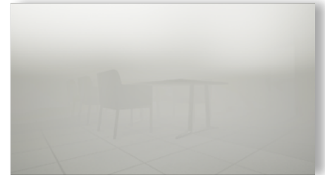
Commercial Building Fire Scenario