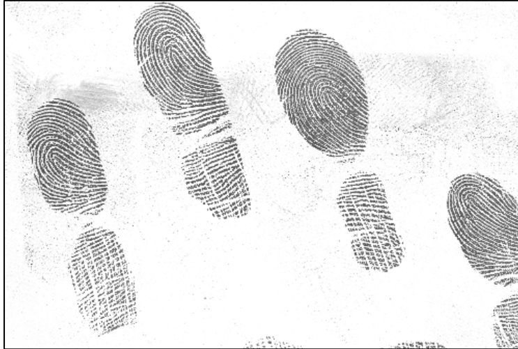
Figure 3. “Noisy” slap image.

Background noise such as extraneous print lines, printed letters, smudges, etc near the boundary of the slap print pose an additional challenge for segmentation. (See Figure 3.) “Noise”, which may also be caused by dirt on the platen surface of the scanner, is most problematic in low contrast images.