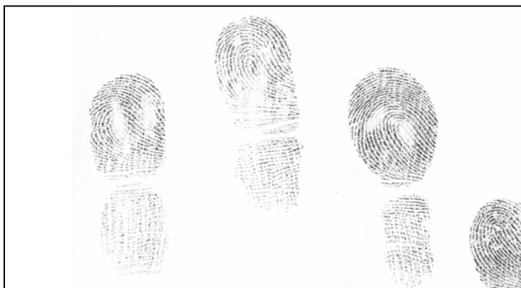
Figure 2. Low Contrast slap image.

At the opposite end of the spectrum, an excessively dry or under inked finger or a fingerprint captured using uneven pressure may be detected as several components due to down sampling or improper thresholding. (See Figure 2). Whether to merge or delete these components depends on the relationship between each sub component and the rest of the components. Segmentation algorithms often use contrast equalization to enhance ridge detail and allow for better segmentation. Though this process can sometimes improve the matching quality of the segmented fingerprint, it sometimes has the opposite effect. However, SlapSegII will not judge the effect these changes have to fingerprint image's quality in regards to matching as SlapSegII will focus on segmentation, not matching.