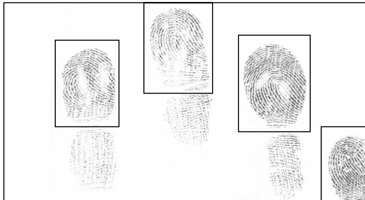
Figure 6. Sample Ground Truth Boxes.