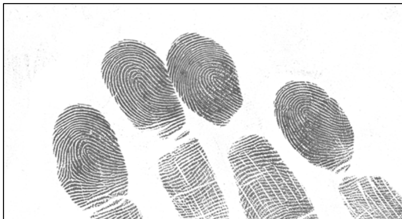
Figure 1. Middle fingers touching in slap.

Slap segmentation can prove difficult due to a variety of scenarios. The most common challenge scenarios include fingerprints that are not clearly separated in an image, a fingerprint which appears as multiple images in a slap, background noise, the “halo” effect, and rotation. Many of these problems are the same as those that existed in the SlapSeg04 evaluation but the use of newer 3 inch platen capture devices can reduce problems such as finger spacing and rotation.