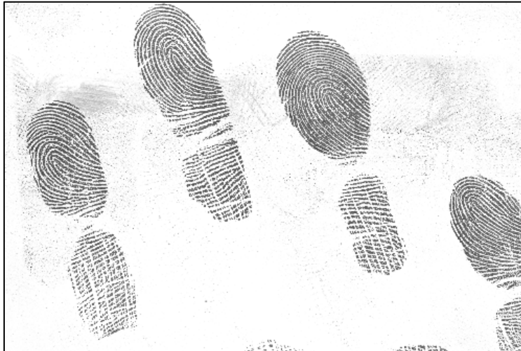
Figure 3. “Noisy” slap image.

Background noise such as extraneous print lines, printed letters, smudges, etc near the boundary of the slap print pose an additional challenge for segmentation. (See Figure 3.) “Noise”, which may also be caused by dirt on the platen surface of the scanner, is most problematic in low contrast images.