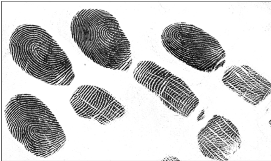
Figure 5. Slap rotation.

Image rotation poses an additional problem when a scanner with a two inch high scanning surface is used, as well as in some older paper data which has been scanned electronically. (See Figure 5.)