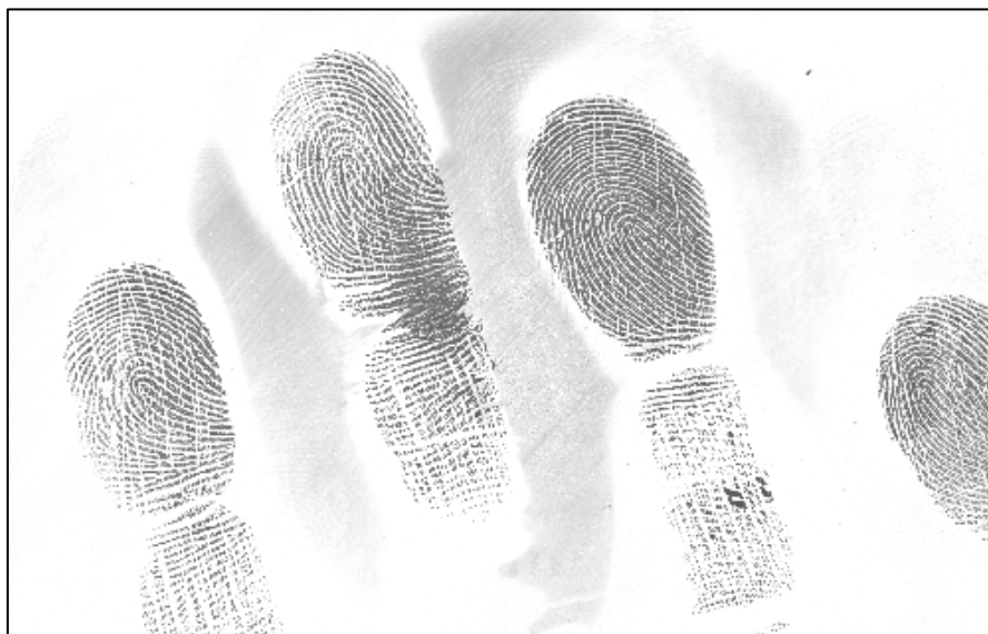
Figure 4. Moisture/Condensation on the platen surface.

The “Halo” affect can make segmentation difficult as it introduces noise to the image. (See Figure 4.) The “Halo” affect is a moisture build up on platen surface of the scanner due to temperature variations (i.e. a warm hand being placed on a cool scanning surface).