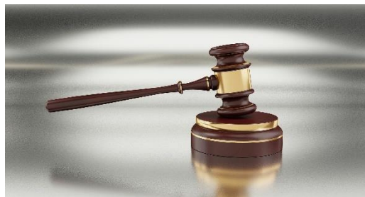
Help develop a standard for training on legal issues.