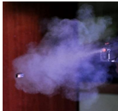
Participate in OSAC's organic GSR interlab study.

Visit the Gunshot Residue Subcommittee webpage to learn more about the study and how you can participate.