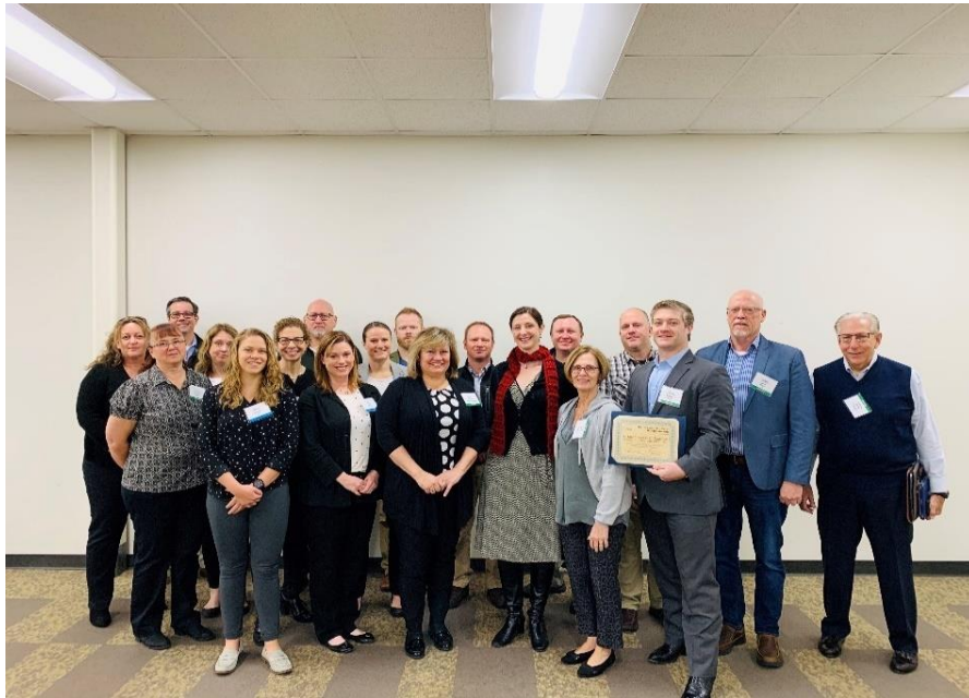
Members of the Crime Scene Investigation Subcommittee, recipients of OSAC's 2020 Distinguished Group Service Award.